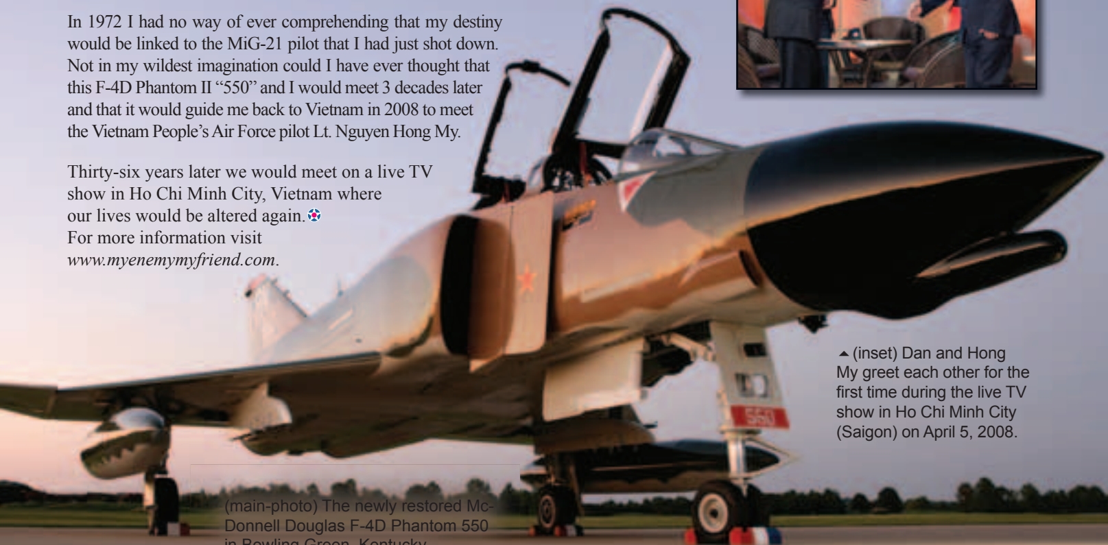
(main-photo) The newly restored McDonnell Douglas F-4D Phantom 550 in Bowling Green, Kentucky.